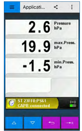
Example for measurement on EuroSoft live app