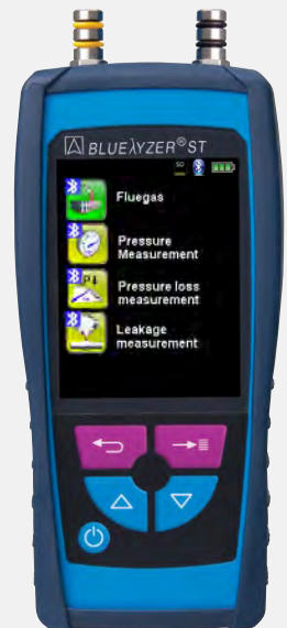
Example on our BLUELYZER ® ST