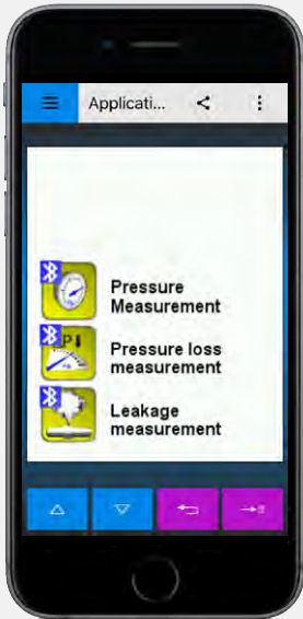
Example on your Smartphone